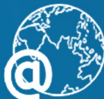
Domain & Hosting